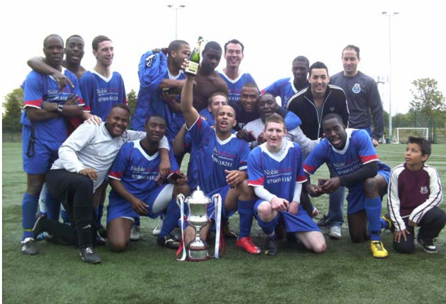
...then followed it up with the Premier Division Cup.

Dun Cow didn't make a Final last season, but have made both of the big ones this season...facing Nirankari in both, Part I is tonight.