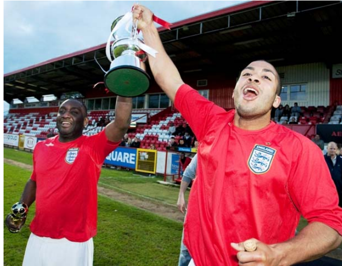
Unity Nirankari won the KLM Challenge Cup...